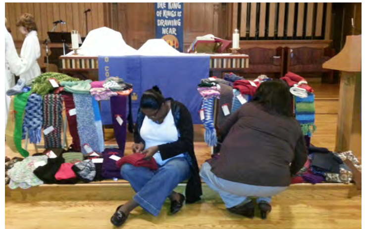
Scarves on Grace's Altar that were being donated to Uptown.