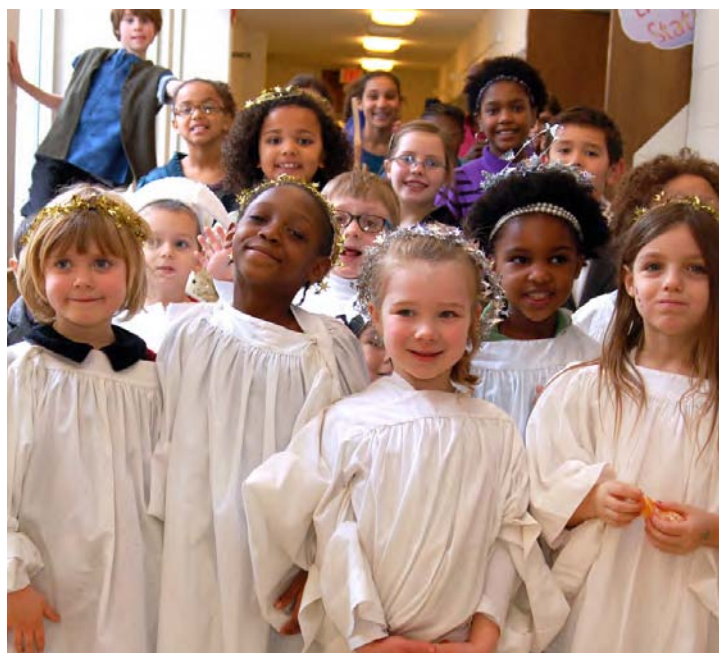
Getting ready for the Christmas Pageant.